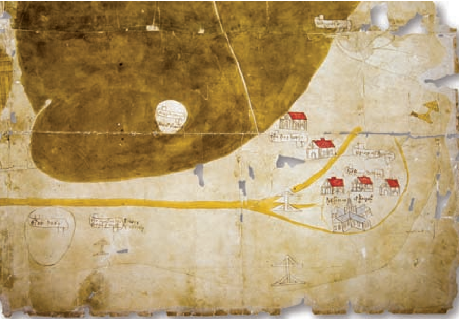
A map of south-west Fylde c.1530. This is a certified copy, drawn in 1700, of an original map in the National Archives. The original was prepared, in approximately 1530/32, as part of the evidence in a dispute between the Lytham Priory and the lord of the manor of Layton. It is the earliest known map to mark the site of 'the heyhouse'.

DDCL 685 MAP 7.